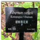
Sample Botanical Label