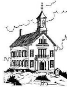
Town Hall Entrance