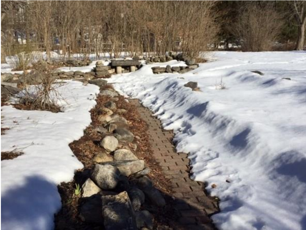
Herb Garden in Winter

https://tulipsinthewild.com/pages/page0.html