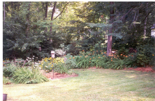
Lawn area reduced by drought-tolerant plantings